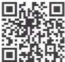
eAlerts Mobile Signup Page

Use the QR code below to connect with us on Facebook https://m.facebook.com/cityofwintersprings