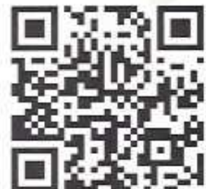
Winter Springs Facebook Page

http://www.winterspringsfl.org 407-327-1800